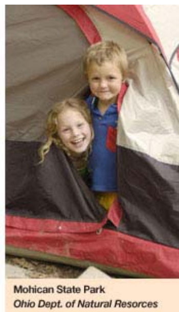
Mohican State Park